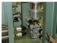
CUSTOM ENGINEERED FIXTURES