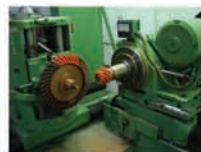
GLEASON UNIVERSAL GEAR TESTER