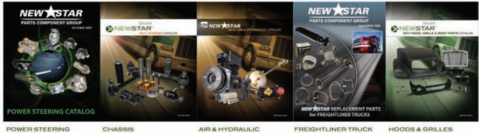
POWER STEERING CHASSIS AIR & HYDRAULIC FREIGHTLINER TRUCK HOODS & GRILLES

OR CONTACT US TO RECEIVE OUR CATALOGS IN THE FOLLOWING FORMATS: PRINTED CATALOG CD-ROM