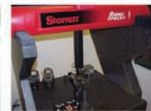
COORDINATE MEASURING MACHINE (CMM)