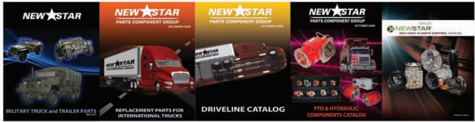
MILITARY TRUCK INTERNATIONAL TRUCK DRIVELINE PTO & HYDRAULIC HVAC