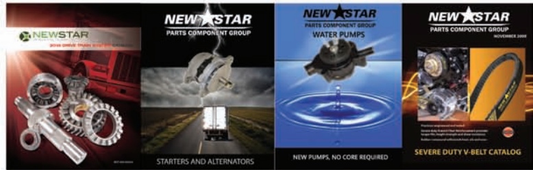
DRIVE TRAIN STARTERS & ALTERNATORS WATER PUMPS SEVERE DUTY V-BELTS