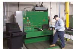
DUMP PUMP TESTER