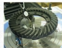
CNC GEAR CHECKER