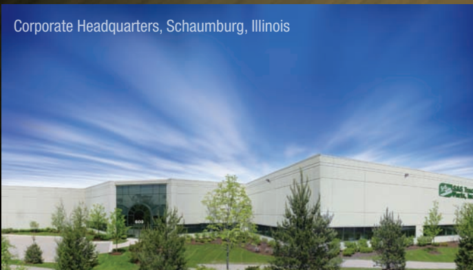
Corporate Headquarters, Schaumburg, Illinois

Look for our full line of new product catalogs online at sandstruck.com/catalogs and at your authorized distributor.