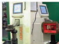
MITUTOYO HR-500 ROCKWELL HARDNESS TESTER