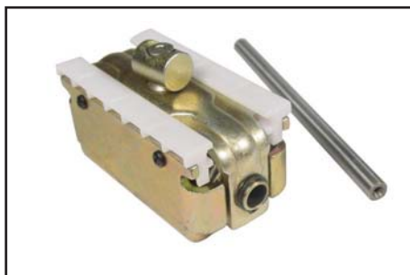
SLIDER AND SHAFT ASSY.

SUITABLE FOR DANA® (FORMERLY EATON) AXLES