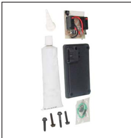
CIRCUIT BOARD KIT W/ COVER & HARDWARE